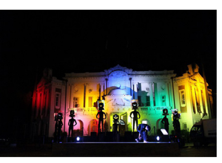
The Taichung Light Festival is held at historic sites throughout the city in June and July.

ernment organizes a wide variety of activities around the procession. Twelve of the Mazu temples in Taichung are more than 100 years old, among them Dajia Jenn Lann Temple. To highlight these historic sites, the Cultural Affairs Bureau stages an event called A Century of Magnificent Mazu Temples, a series of traditional performances in genres ranging