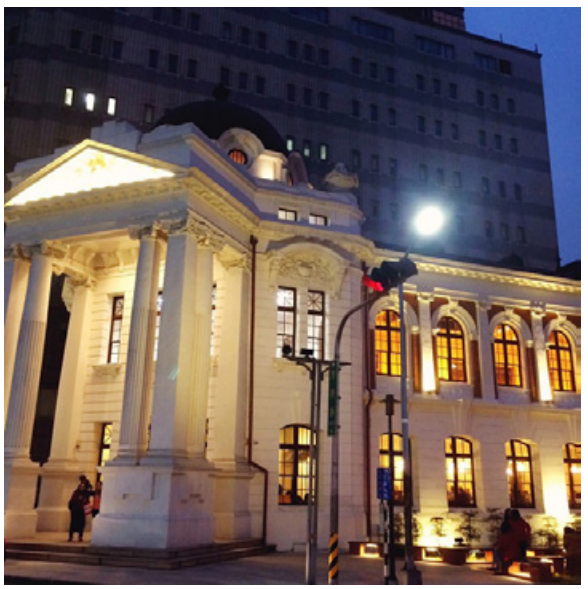
The historic Taichung Shiyakusho building in central Taiwan's Taichung City has been converted into a cafe and arts center.

More than half of the troupes and musical acts that perform at the festivals are